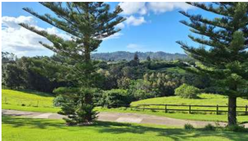
Victorian Pistol News March 2026

it was a true International competition.