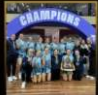
NSW WARADAS Netball