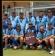
NSW BLUES MEN'S STATE SIDE Bowls