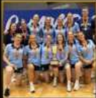
NSW U20 WOMEN Basketball