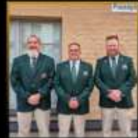
TPA NATIONAL METALLIC SILHOUETTE PISTOL TEAM Pistol