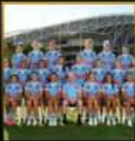
NSW BLUES WOMEN Rugby League