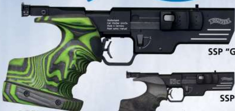
SSP "GREEN PEPPER"