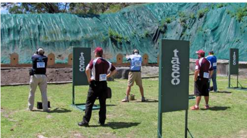
Ready for 7 yards 'Practical' series