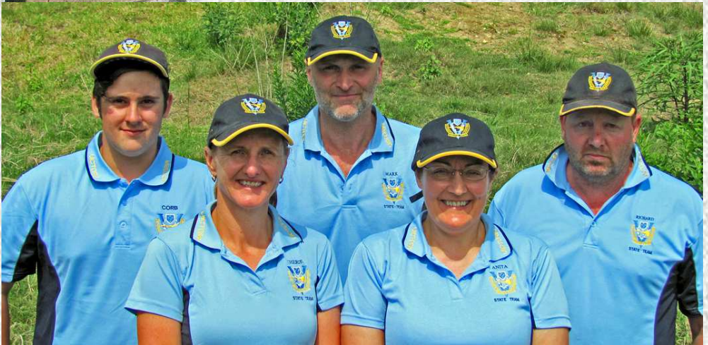
Victorian Action Match team attend the Nationals at St Ives NSW in October