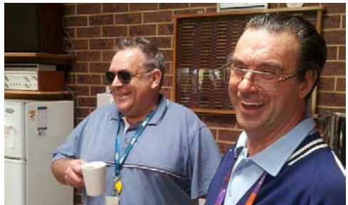
Two Peter's relaxing