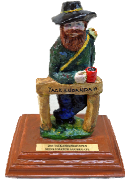
The Yackandandah aggregate trophy