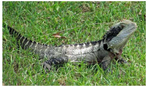
Local resident came to look