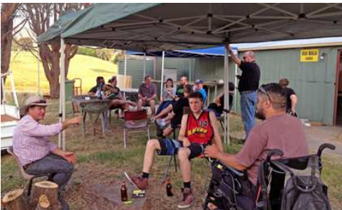
A great place to relax after the shooting