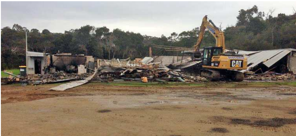
Excavator clears away the damage