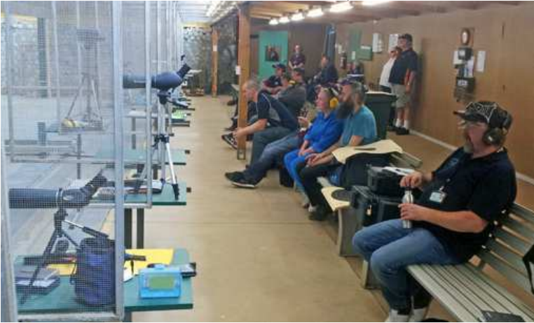
Shooters watching the scoring at Melton