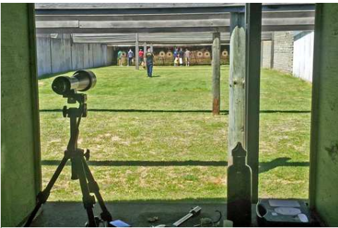
Checking targets in 50m Pistol