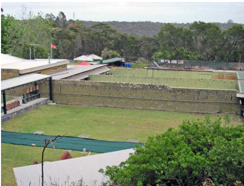
Some of St Ives PC ranges

Weather during the Nationals was pleasant, mid to low 20's most days,