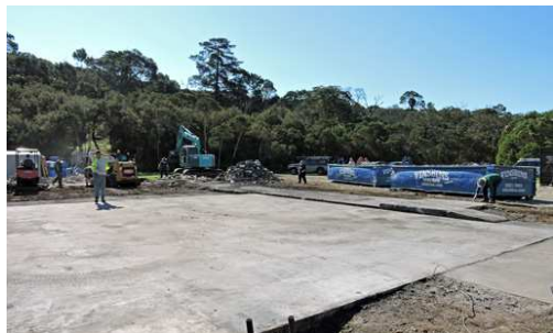
All that remains here; the concrete slab