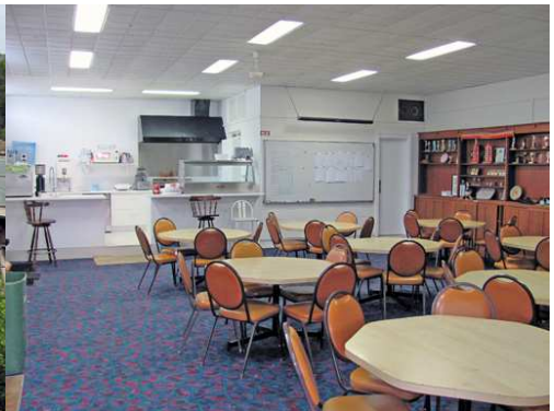
St Ives PC club house