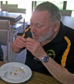
Even the new president needed some food