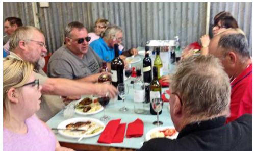
Like a big family; enjoying Saturday nights dinner