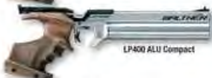
LP400 ALU Compact