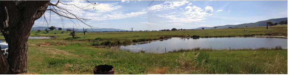
Yackandandah has a great outlook