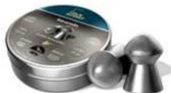
.22" Pellets H&N Barracuda