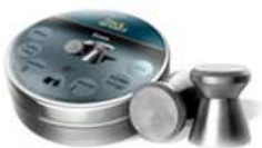
.177" Pellets H&N Econ

Haendler & Natermann are the market leader in the production of air pellets. Their latest packaging now makes it even easier to select the right pellet.