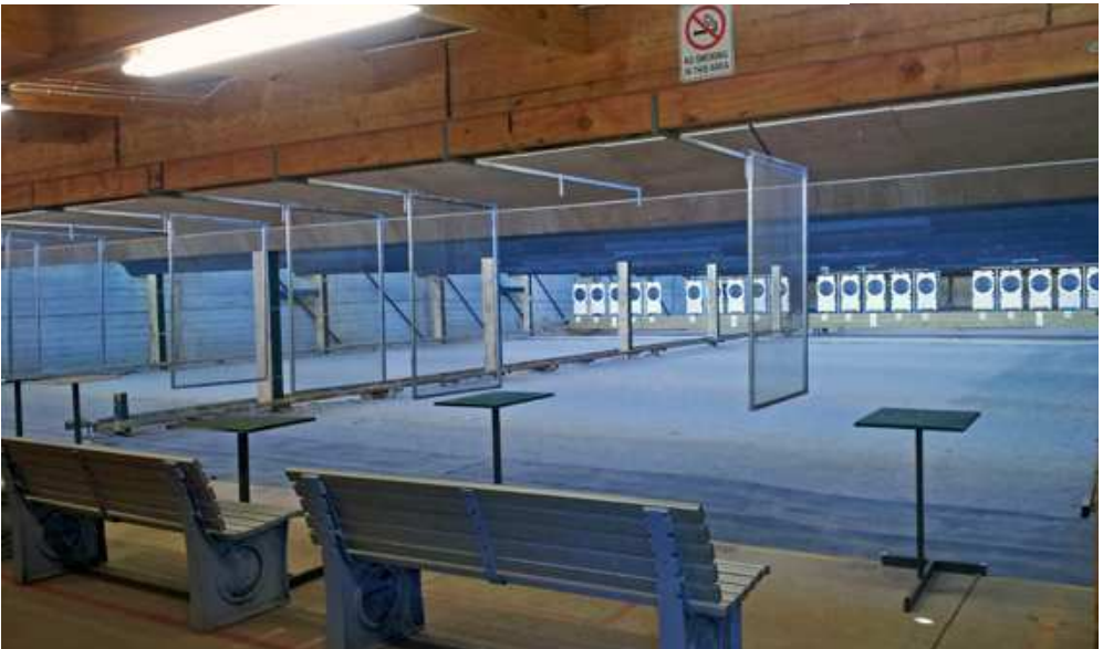
25m range setup ready for Rapid Fire