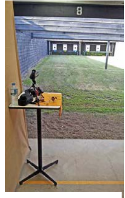
All set for Standard Pistol preparation time

If you check the Top Ten on pages 38-40 you see a few results from Oakleigh