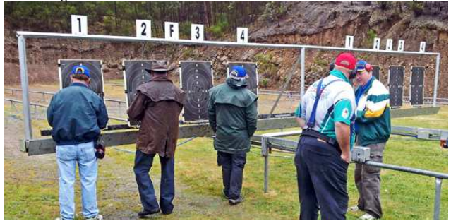
Scoring and patching