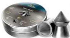
.25" Pellets H&N Ram Point

A wide selection of pellet types are available in various sizes .177", .20", .22" and .25"