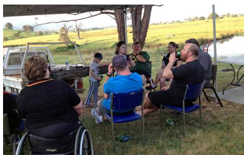
Relaxing in the pleasant surroundings