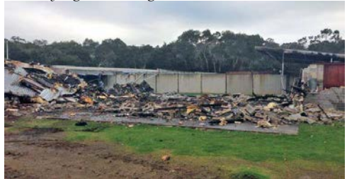
Some of the damage, above and below