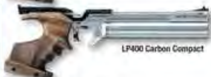
LP400 Carbon Compact