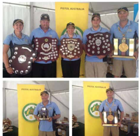
Victorian members display their rewards—congratulations