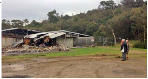
Surveying the damage ... What now?

Anyone with information about either of the break-ins should call Crimestoppers on 1800 333 000.