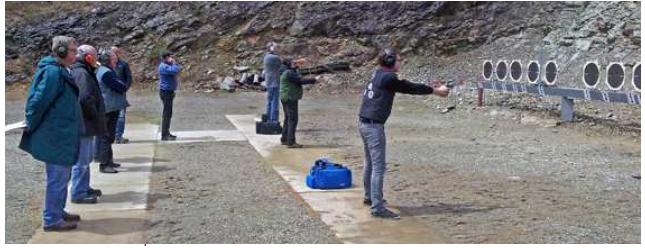
Shooting Service 25 in the wet (should have seen it Saturday)