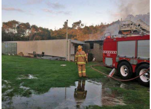
Fire trucks on scene