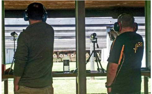
Shooters on the 50m range