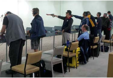
Air Pistol was well supported