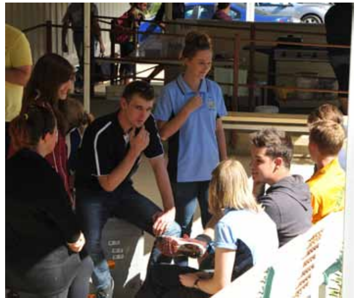
At the Nationals 2014