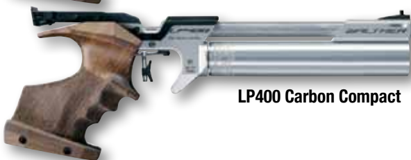
LP400 Carbon Compact