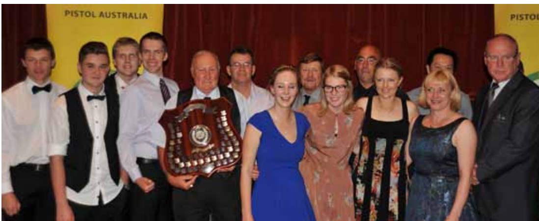
Presentation Adams Trophy