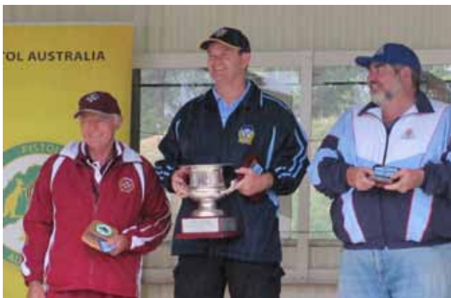
Above : Black Powder 25