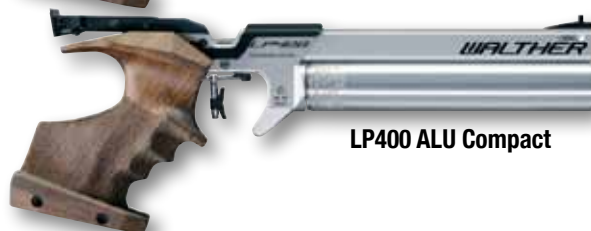
LP400 ALU Compact