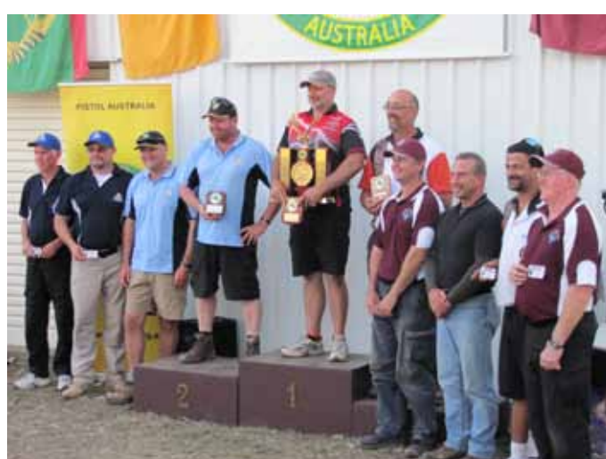
Top Ten Open

Our Team took advantage of the practise day, 3rd October and completed formalities, equipment control, etc. then returned to our accommodation to prepare for the competition the next day.