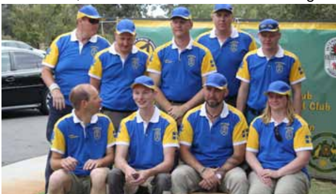
The Swedish Team