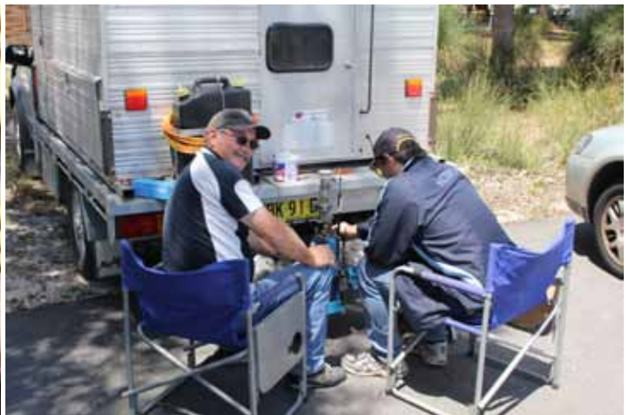
Reloading on the spot

During discussions with the Internationals, we found their training routines and practices were also unique to the weather conditions in northern countries, with up to 4 months of the year when shooting outside is impossible due to the cold and snow. During this time, they spent in preparation of the pistols and loading the 25,000- 30,000 rounds they will shoot in the warmer months. A group of shooters from Sweden decided to purchase some projectiles from Germany as local prices were too dear, and they ordered 4.5 tonne at 65 Ore each. (There are 100 Ore to the Krona, and 1 Krona at the time of writing this article equalled A$0.18).