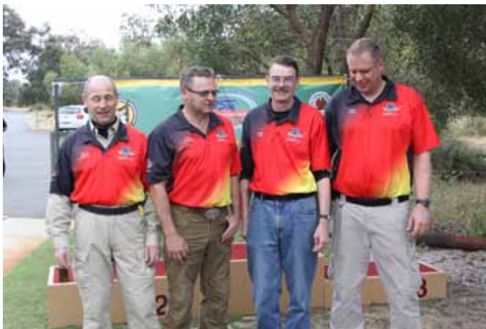
German Team ( World Champ LHS )

I feel that our group gained from the experience of attending the World Championships and I am sure the knowledge gained will filter down to others as we attend the Open competitions coming up during this year.