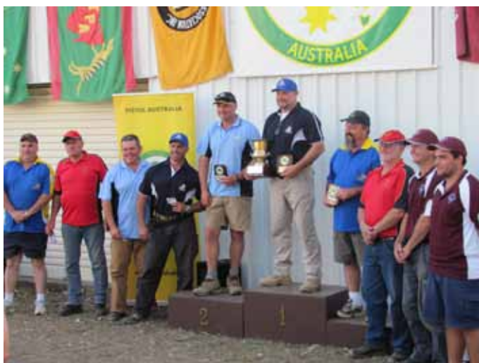
Top Ten Metallic