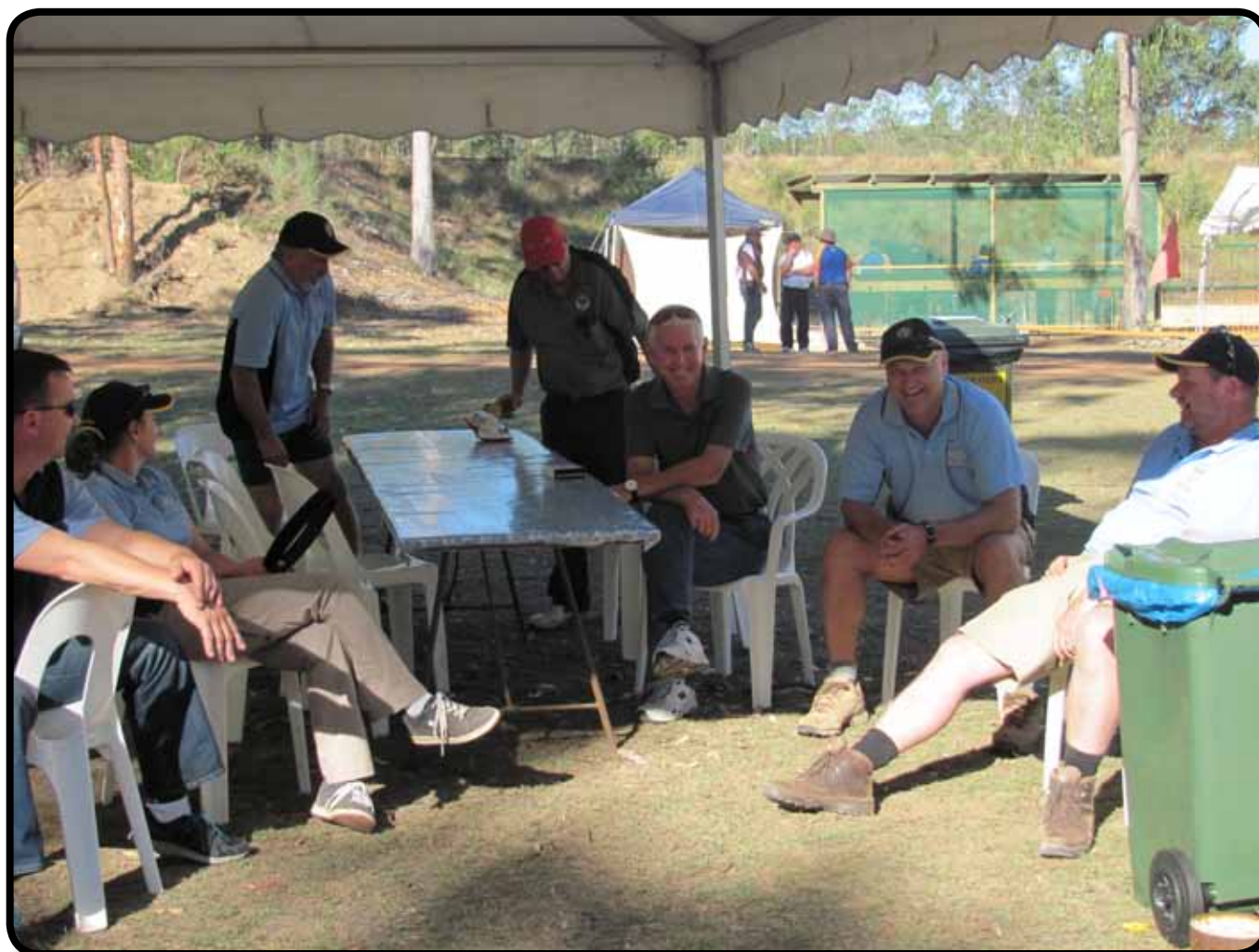
Relaxing at the Action Pistol Nationals