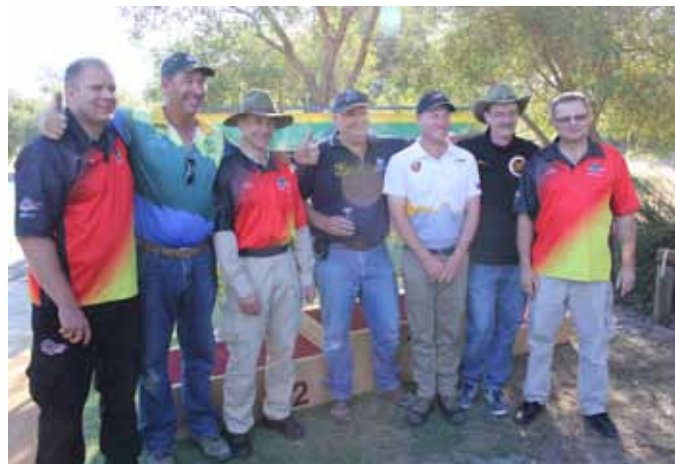
Aussies & Germans