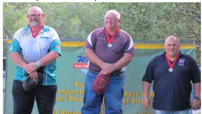
One Vic on the Dais