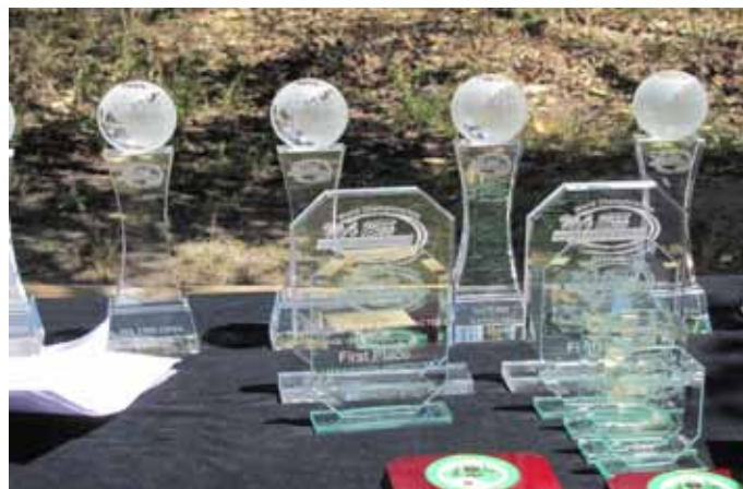
Some of the Trophies

Trophies for this competition are awarded for Outright and also grades, hence the presentation on the final day went for nearly 3 hours. A full list of results and photos may be found at http://www.2013wa1500worldchampionships.com/results-and-photos.php