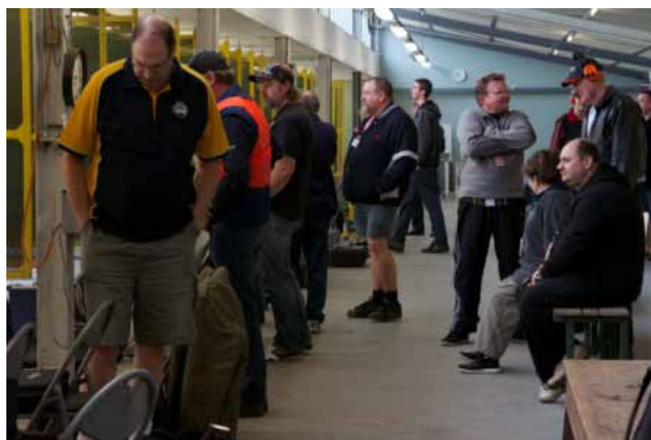
Above: Preparations for the 25m Centre Fire/Sport Pistol.