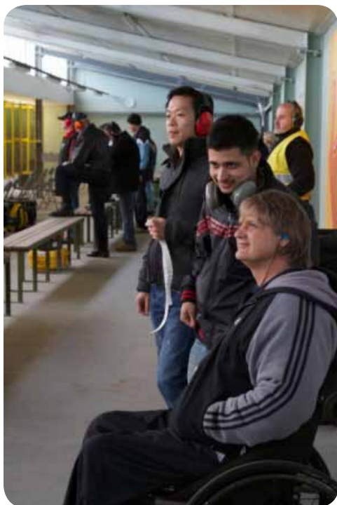
Left: Misc helpers watch on Standard Pistol.