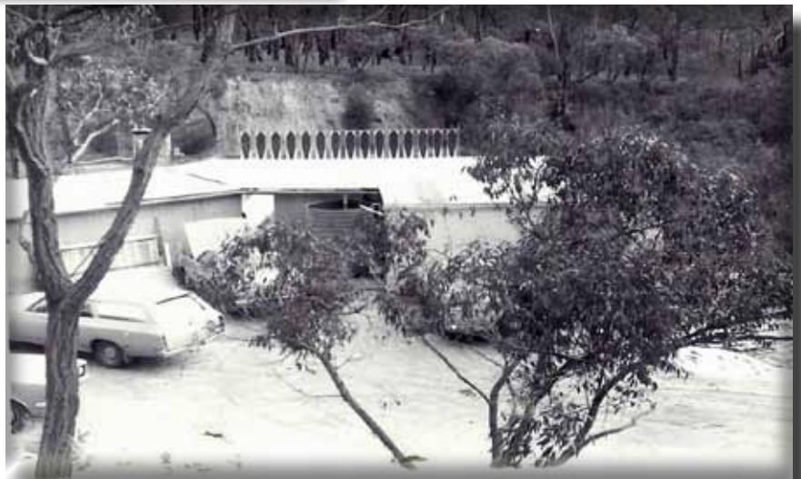
Sale PC Range . approx 1976