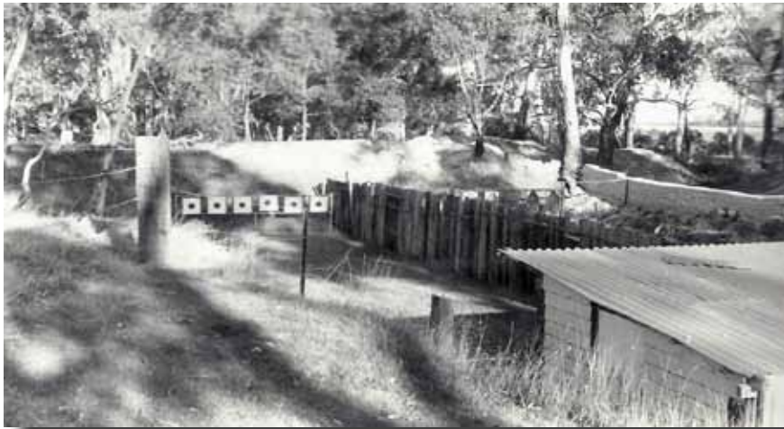
Beaconsfield PC Range. approx 1976