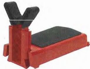
THE MTM PISTOL REST

The most important thing is to create a fair testing environment. That means under conditions where the variables are controlled as far as possible. The testing should be a fair comparison between the different brands of ammo. The ammo's performance should be evaluated at the