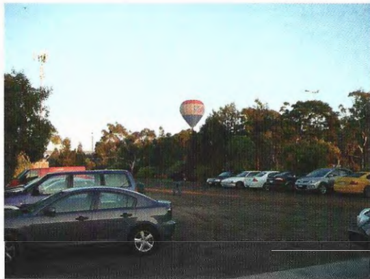
Hot air balloons seen over Melbourne in Winter

In May the 55th MISC open was held. As one of the oldest clubs, this annual event was held in perfect Melbourne Autumn weather, although the hot air balloons hovering over the Melbourne skies indicated a cold start to the day. Since its initial days, the open has expanded to include rifle events - both benchrest & ISSF - as well as the traditional pistol competition.