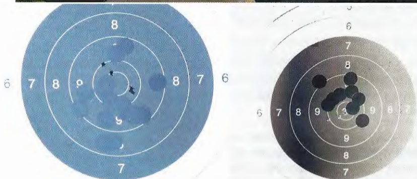
Chris Roberts in action - 98 in Standard at 20 seconds